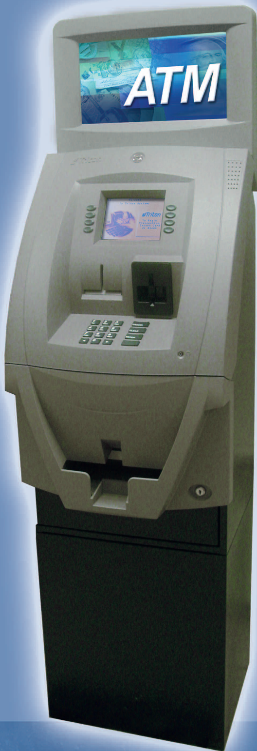
8100 with topper

The 8100 is our lowest cost ATM designed for merchants with low-traffic, tended locations who are over served by bigger, more expensive ATMs.